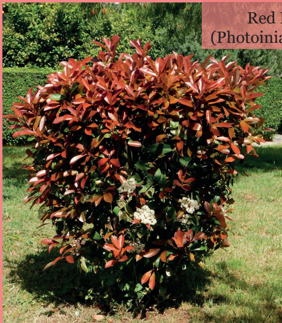
Red Robin (Photinia x Fraseri)