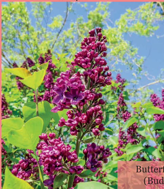
Butterfly Bush (Buddleia)